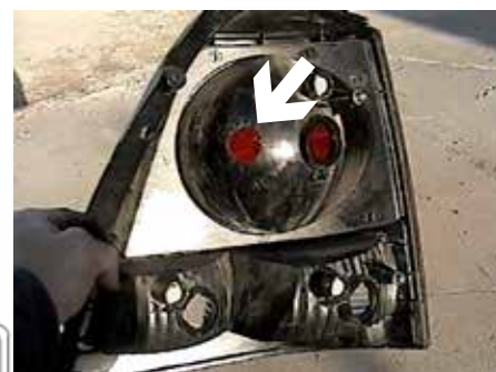
Location for the Bx8869 on driver's side tail light assembly.