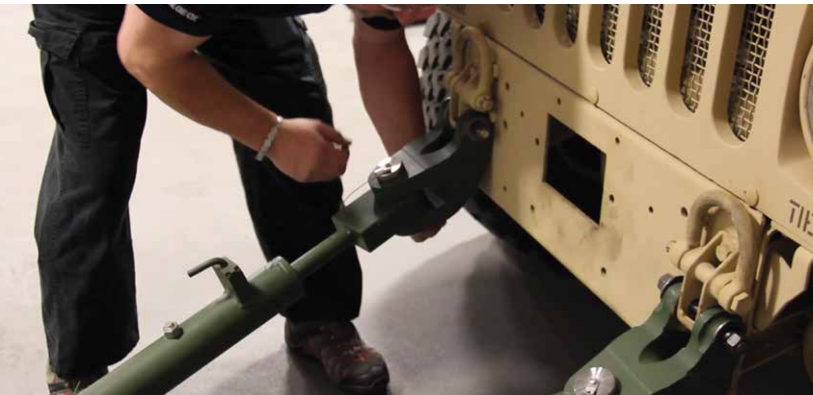
Slide retaining clip into the clevis pin.