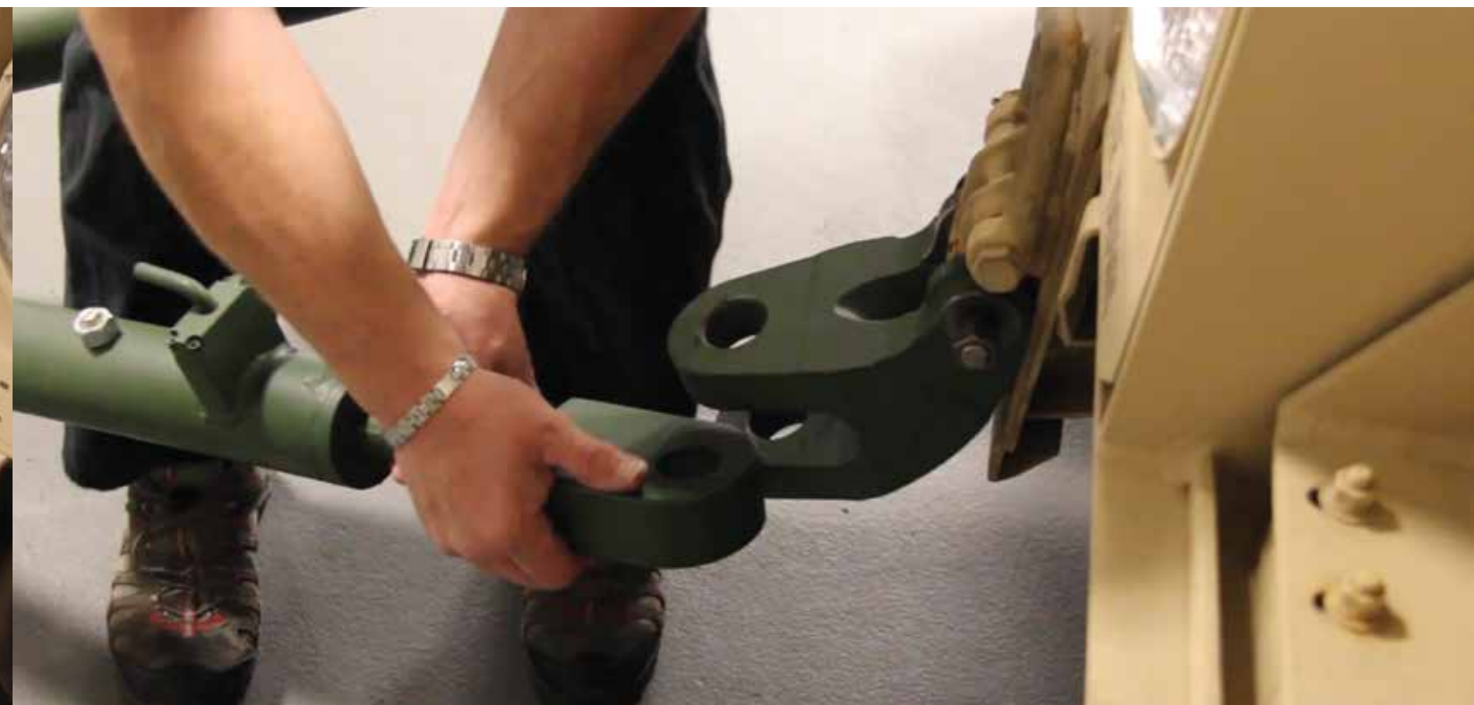
Repeat steps to quickly connect opposite leg.