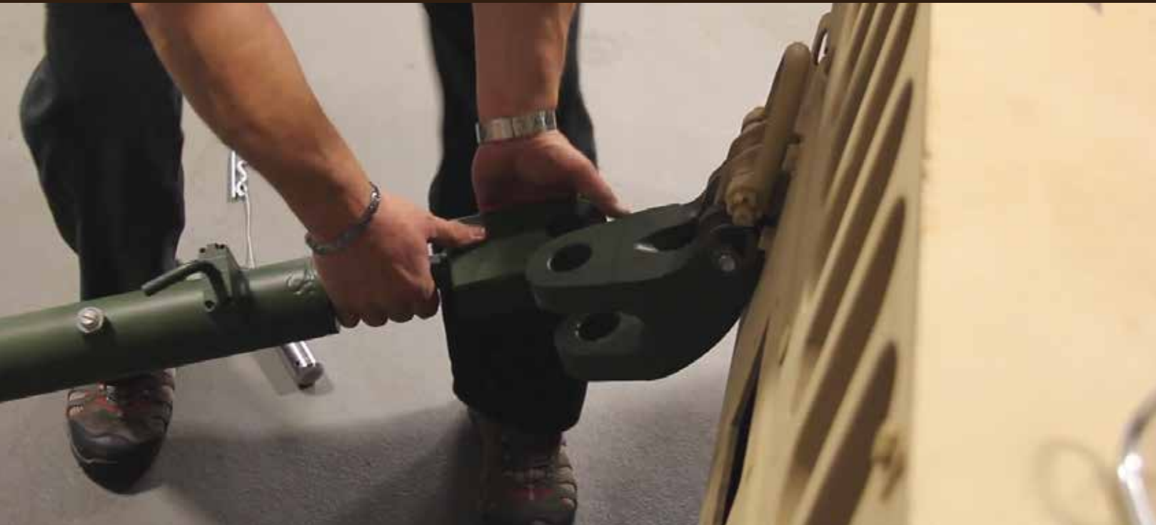
Slide tow bar leg clevis into vehicle bumper adapter.