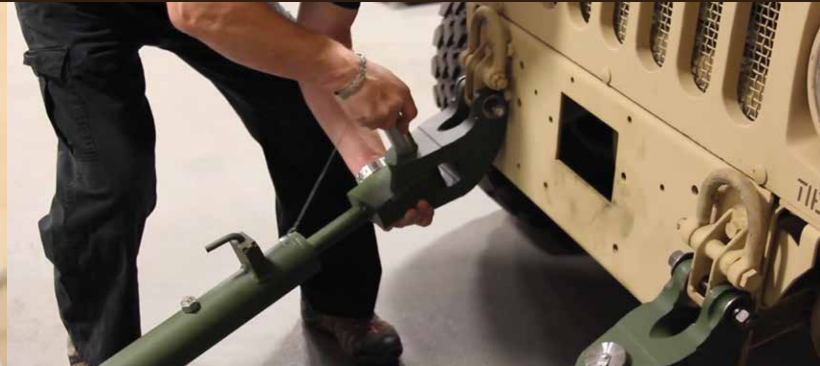
Insert clevis pin.